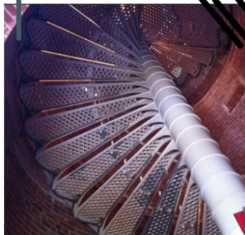
"golden ratio lighthouse stairs"

Golden Ratio: Similar to the Rule of Thirds, placing key elements along the spiral or grid can create a pleasing and natural effect.