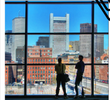
"Boston Rule-of-Thirds HDR"

Rule of Thirds: Dividing the image into 9 boxes. Placing key elements at the intersections or along the lines helps visual balance and engage attention to an object.